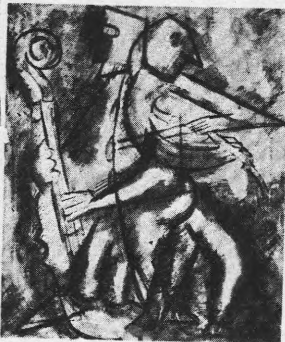
The figures silhouetted against a symbolic hand were painted on rocks in the Libyan desert roughly a hundred centuries ago (and are now shown in facsimile at the Museum of Modern Art).

Other works are a dullish subway scene by Kufeld, Solman's characteristic "Gas Station," a figure group Harris that is richly painted but muddled in the working, an abstraction of Bolotowsky and a serene figure study by Rothkoff, leaning a bit toward the nebulous.