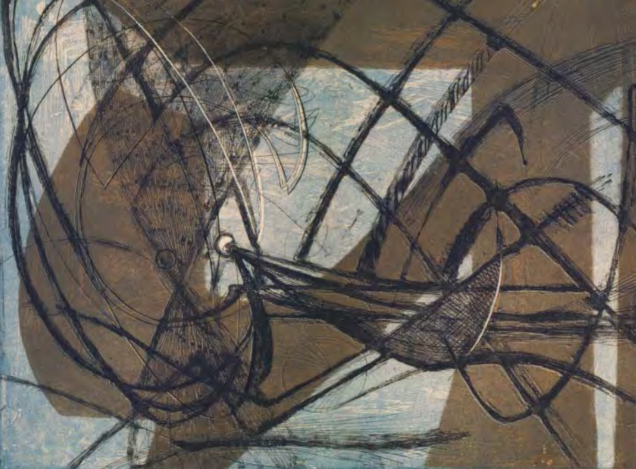
Left: Minna Citron, Squid Under Pier , 1948-49, etching, soft-ground etching, engraving, and stencil.