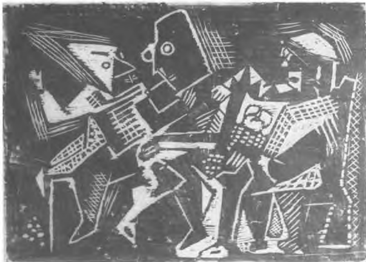
Louis Schanker, 39, Three Men on a Bench , about 1939