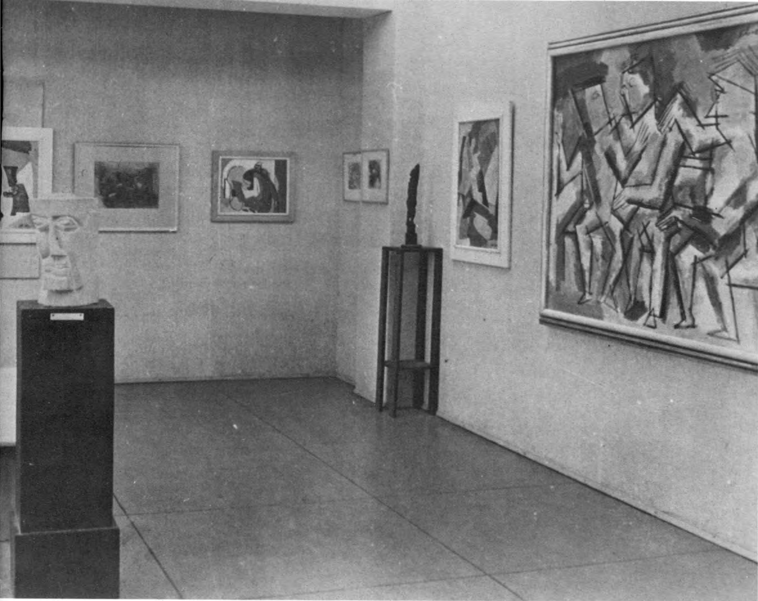
Louis Schanker's wood sculpture, Abstracted Man (center) and oil, Three Men on a Bench (right) at the American Abstract Artists' Squibb Building Exhibition, 1937